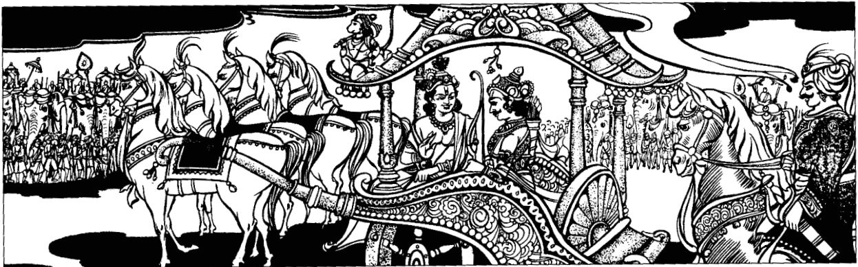
Figure 2c Karma-yoga