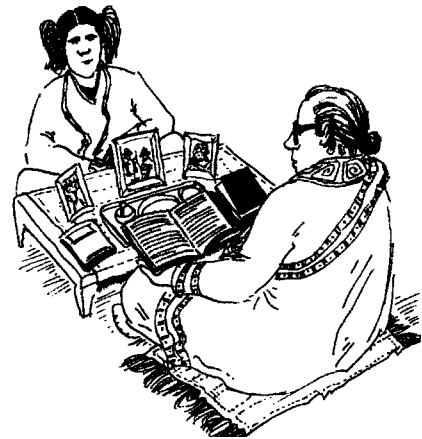
Figure 2b Jnana-yoga