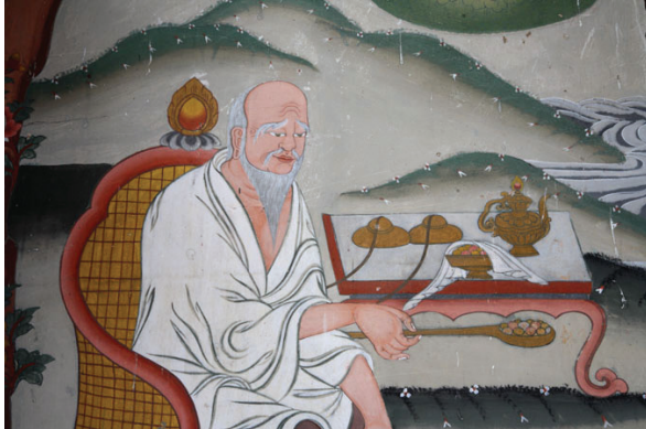
An old man