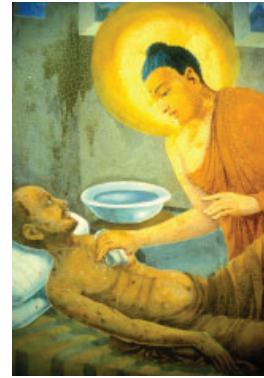
A sick man

A3 (a) Two of the four signs the Buddha saw were an old man and a sick man. Give the other two signs.