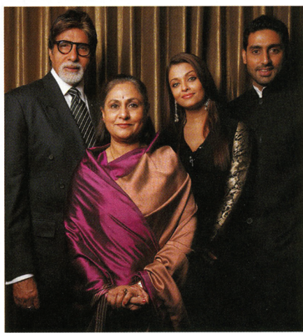
THE BIG FAMILY BACHCHAN The whole clan come to town