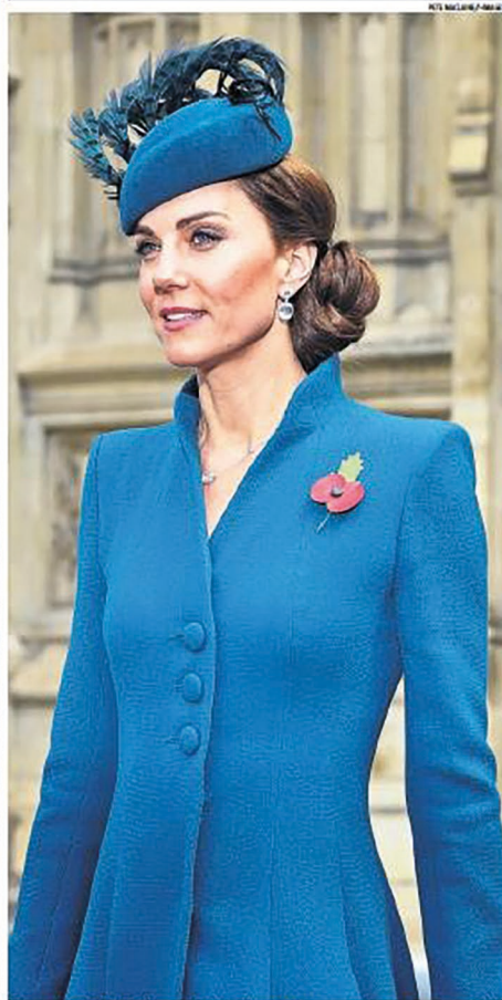
Fitting tribute: The Duchess of Cambridge wore a remembrance poppy to mark Anzac Day at Westminster Abbey yesterday. She was joined at the service by the Duke of Sussex while her husband paid his respects in New Zealand. Page 11