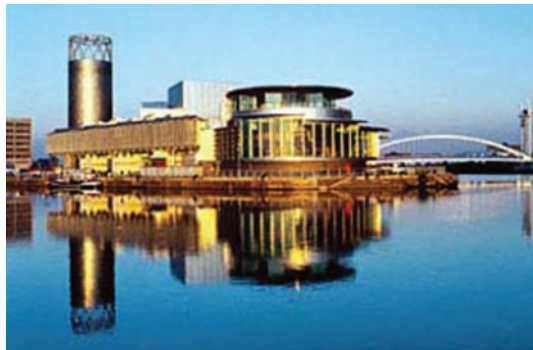
The Lowry Centre