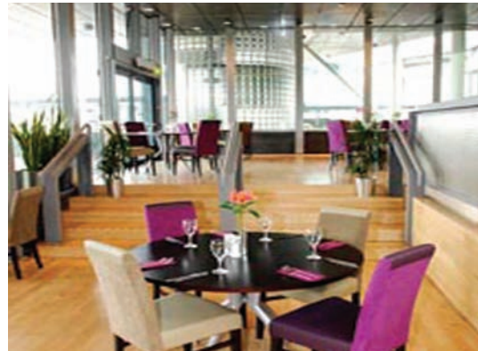
The Lowry Restaurant

The Lowry Centre has world class galleries and exhibitions, theatre productions and an established conference and event venue. The Lowry is only 1.5 miles from Manchester city centre, 20 minutes drive from Manchester Airport, and a quarter of a mile from the motorway network, giving access from all over the North West and beyond.