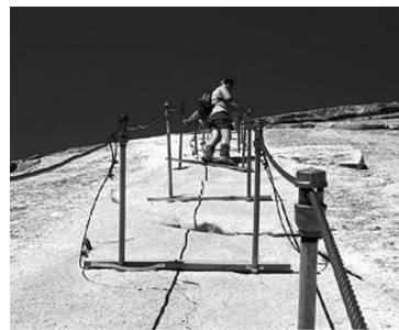
Climbing the cable ladder in July