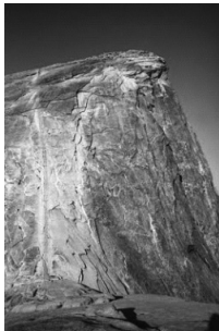
Half Dome – the cable ladder route is to the left

By 2009 the popularity of the route was causing problems. Some hikers had to wait over an hour to get onto the cable ladder. Also the condition of the cables was becoming unsafe, due to them being worn away, and four people died.