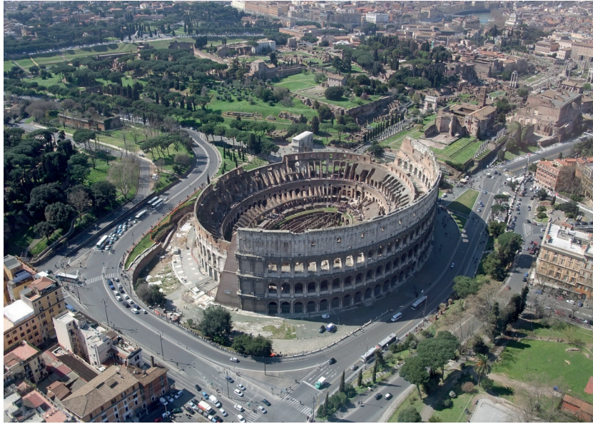
The Colosseum, Rome.