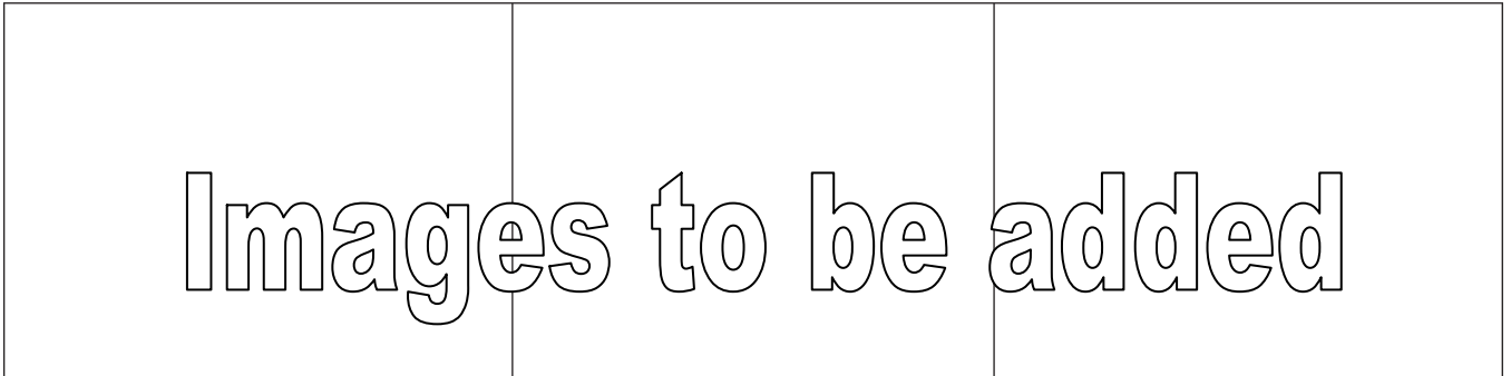
Purple Spiders 1