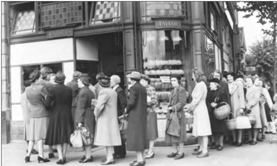
A queue of people waiting outside a shop in 1946