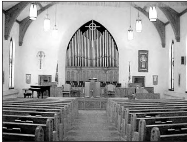
[This is a photograph of the interior of a modern Christian church]

Look at the information below and then answer the questions which follow.