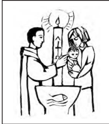
[This is a drawing of an infant baptism, an important religious ceremony.]

Look at the information below and then answer the questions which follow.