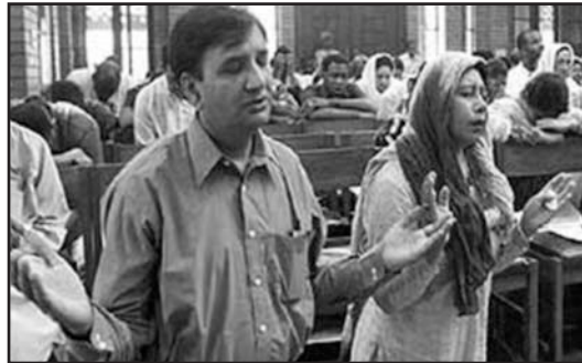
[A photograph of Christians at prayer]

(a) What does Source A tell you about the way Christians may pray? [2]