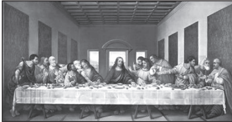
[A painting of The Last Supper – the first Eucharist service]

(d) Explain why the Eucharist is so important to Christians.