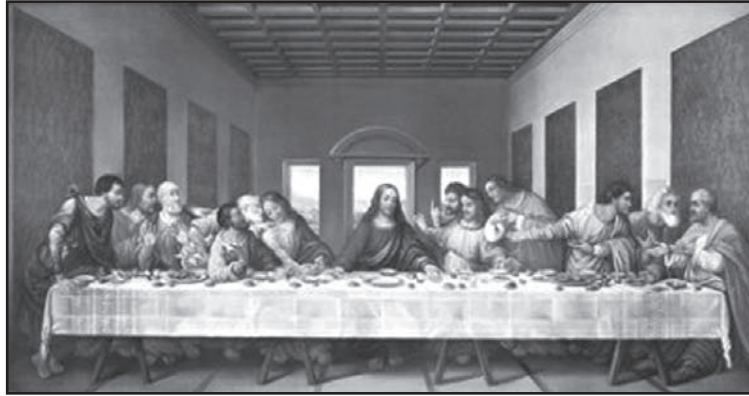
[A painting of The Last Supper – the first Eucharist service]

(d) Explain why the Eucharist is so important to Christians.