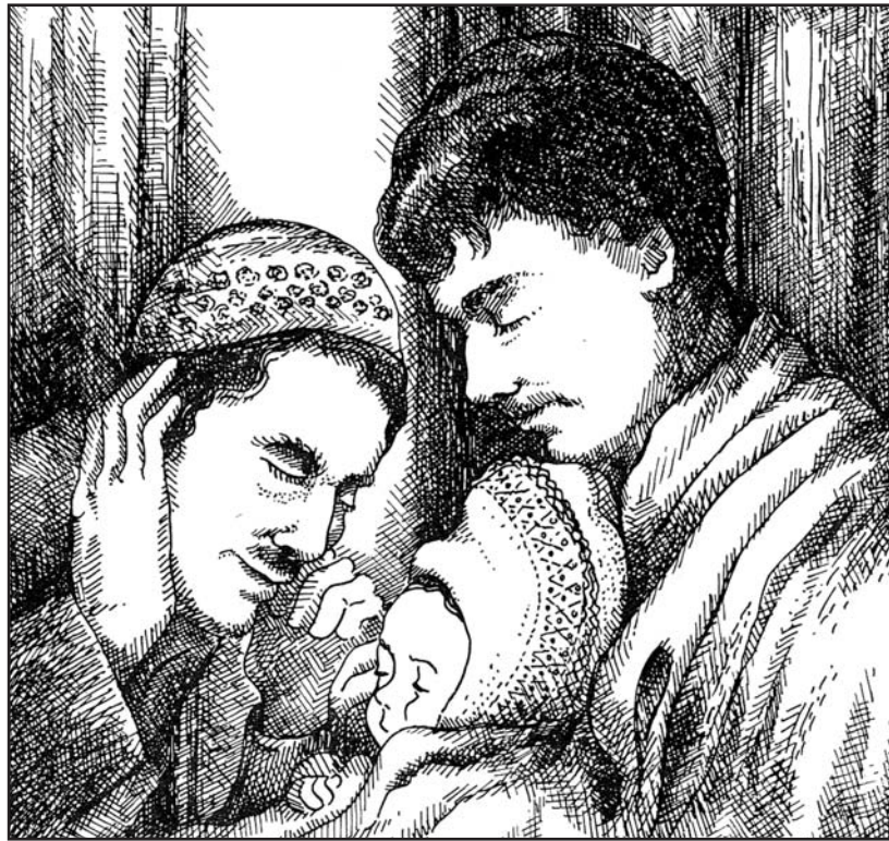
[A Muslim family celebrates the birth of a new baby]