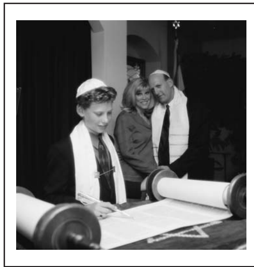
[A Jewish boy celebrating his Bar Mitzvah]