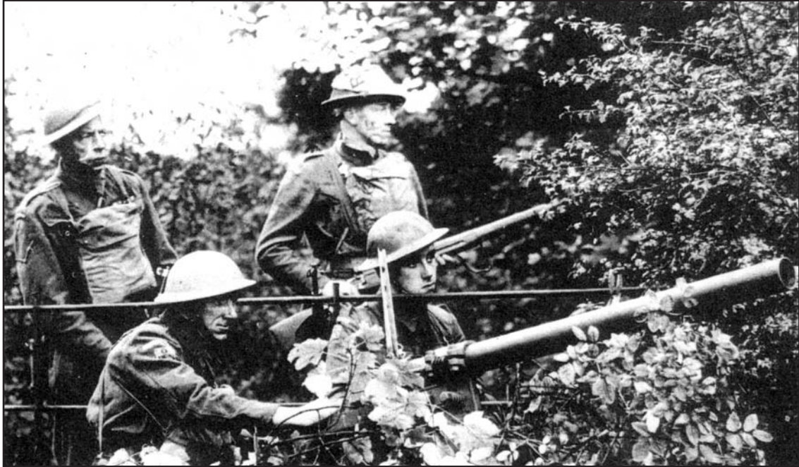
[A photograph showing Local Defence Volunteers during an invasion exercise in Wrexham in 1941]

How useful is Source B to an historian studying the preparations made by the UK to prevent a successful German invasion after 1939?