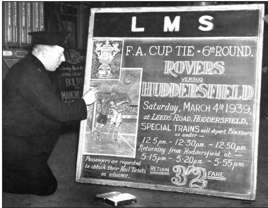
[A railway company advertising board at Blackburn Railway Station, 1939]