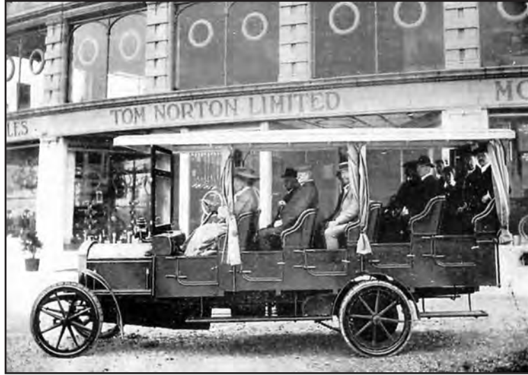
[A charabanc ready for a sight-seeing tour in 1911]

(a) What does this picture show you about holidays in the early twentieth century?