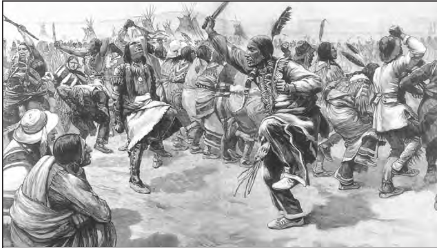
[An illustration of the Ghost Dance performed by the Sioux Indians in 1890. It was hoped this would cause the whites to disappear, the buffalo to return and for dead Indian warriors to come back.]

Study the picture below and then answer the questions which follow.