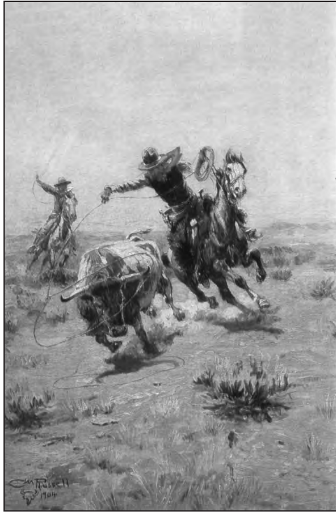
[A painting of a cowboy using a lasso to capture a young bull]

Study the picture below and then answer the questions which follow.