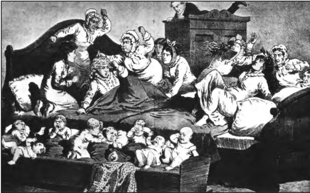
[Many Mormons migrated west because their lifestyle was criticised. This American newspaper cartoon of the 1840s makes fun of the Mormon practice of polygamy]

(c) How far does Source C support the view that the Mormons migrated west because their lifestyle was criticised? [5]