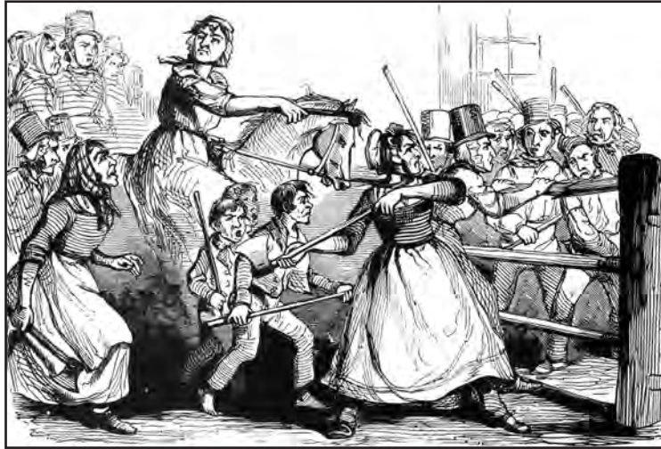
[Rebecca rioters attacking a toll-gate in the 1840s]

(a) What does this picture show you about the activities of the Rebecca rioters?