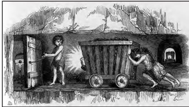
[Children working underground in 1842]

(a) What does this picture show you about working conditions in the mid nineteenth century? [2]