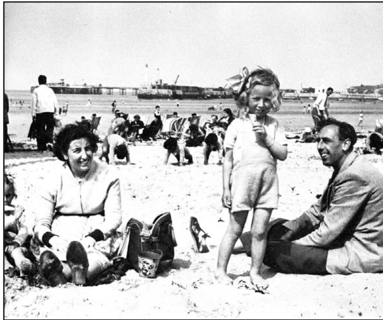
[A family at a British holiday resort in the mid-twentieth century]

(a) Use Source A and your own knowledge to describe a traditional British holiday resort. [3]