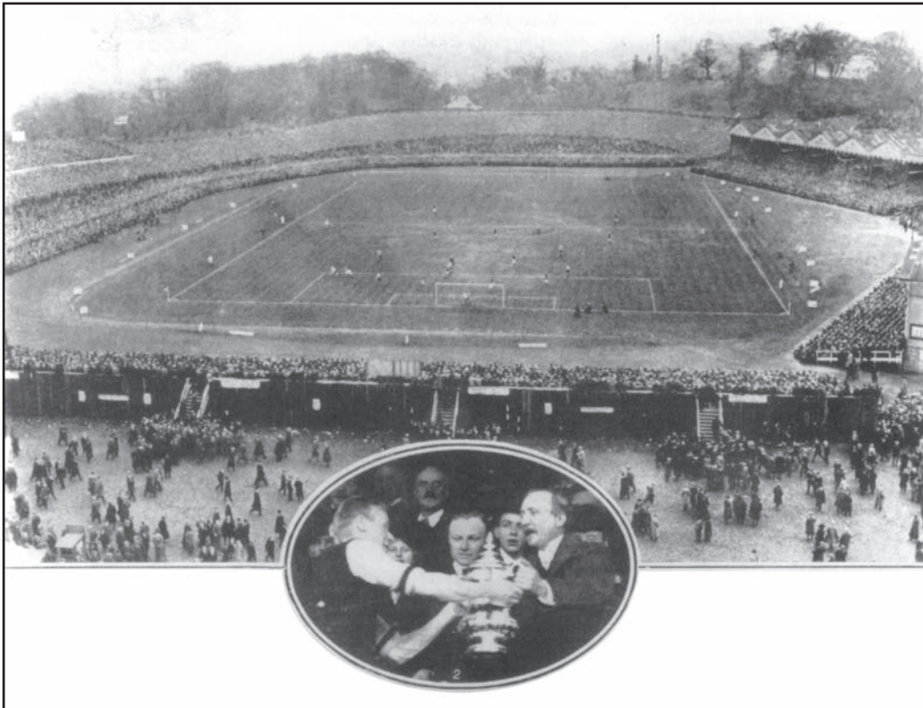
[The 1913 Cup Final at Crystal Palace, attended by a crowd of 120,000]

(a) Use Source A and your own knowledge to describe an FA Cup Final before 1914.