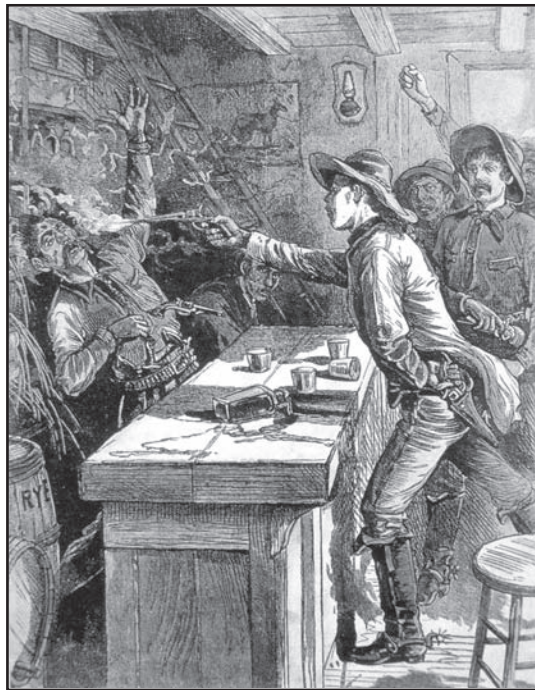
[An illustration showing the killing of a storekeeper by Billy the Kid]

(a) Use Source A and your own knowledge to describe why Billy the Kid became well-known.