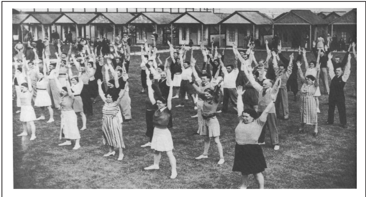
[A photograph of campers enjoying early morning exercises at Butlin's in Bognor Regis, about 1938]

(a) Use Source A and your own knowledge to describe a Butlin's holiday camp.