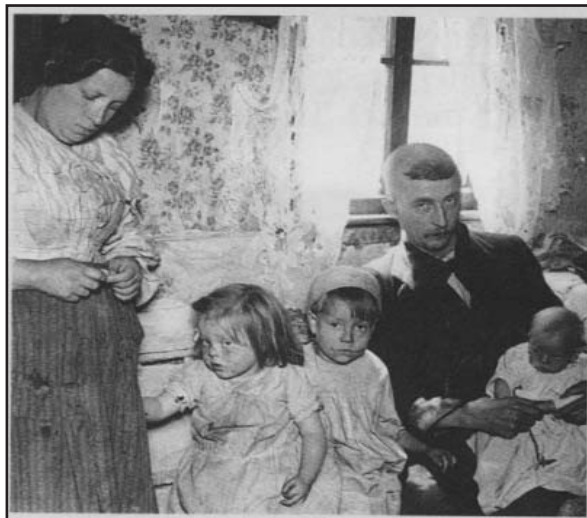
[A photograph of a poor family in 1912]