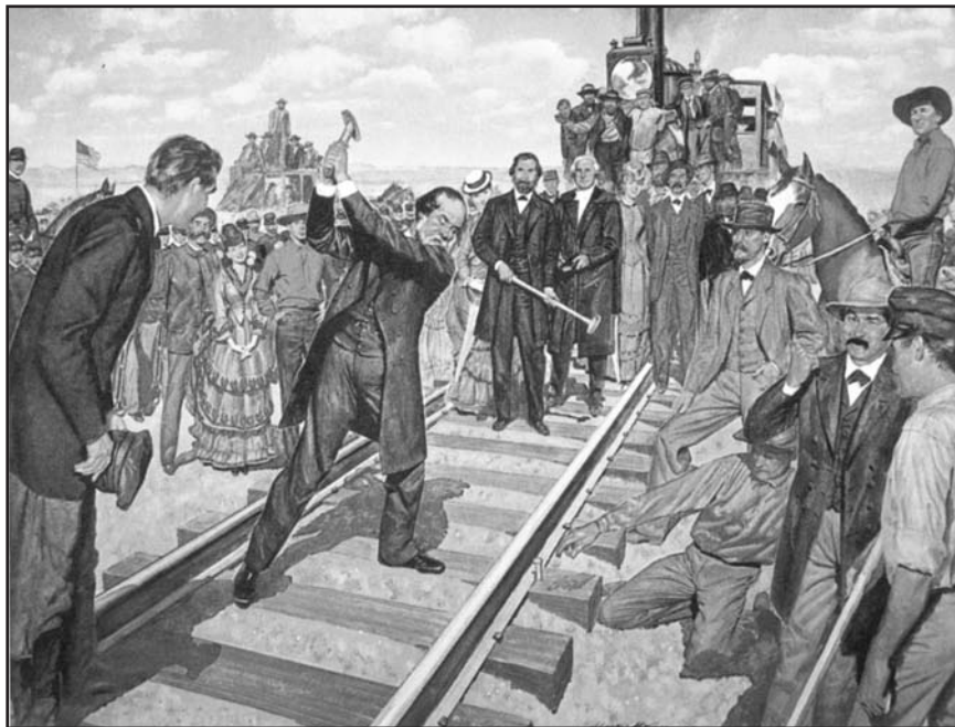
[The meeting of two railroads at Promontory, Utah, in 1869]

(a) Use Source A and your own knowledge to describe the importance of the events at Promontory in 1869. [3]