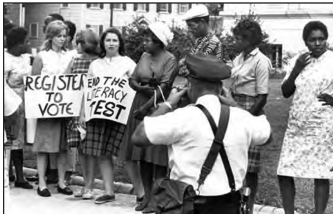
[Americans demanding changes to the voting system in 1963]