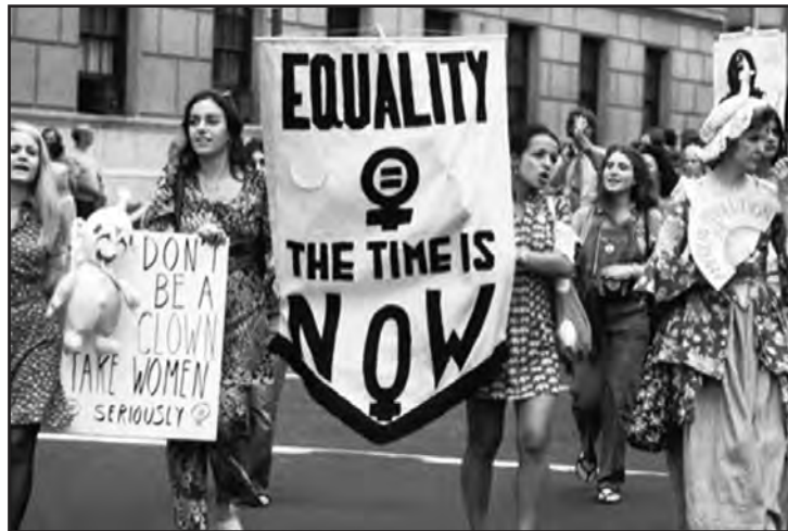
[A gathering of American women in the 1960s]