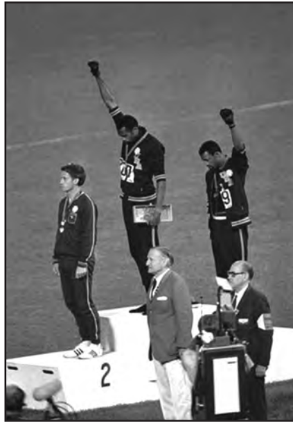
[Two American athletes protesting in favour of Black Power at the Mexico Olympics in 1968]

(a) What does Source A show you about the Black Power Movement in the 1960s? [2]