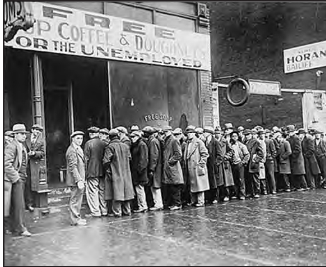
[Unemployed men queuing for food in 1932]