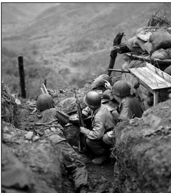
[American troops fighting in South East Asia in the 1950s]