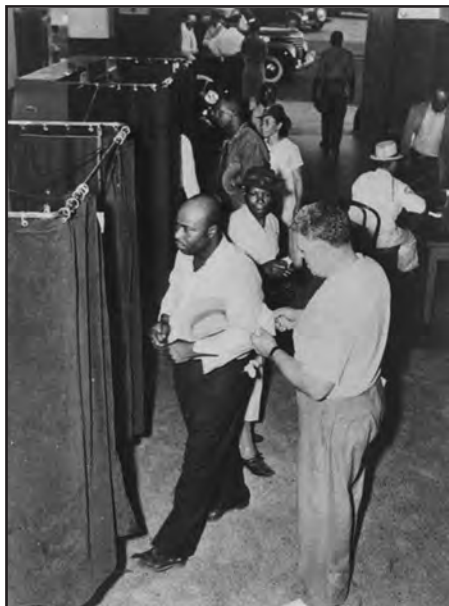
[Black Americans voting in 1965]