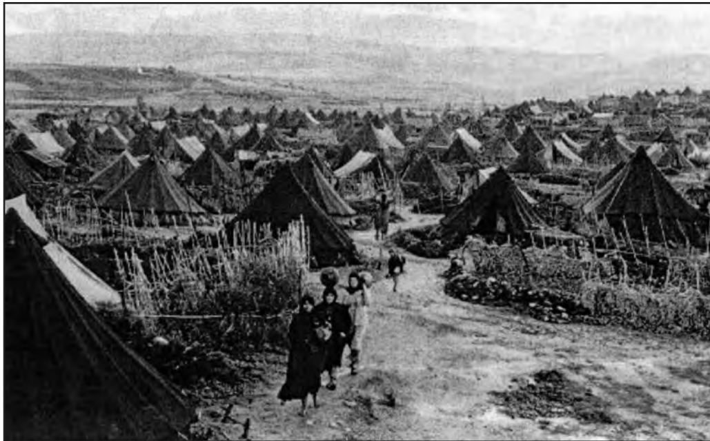
[A refugee camp in Jordan in the 1950s]