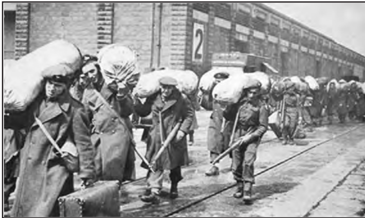
[British troops leaving Palestine in 1947]