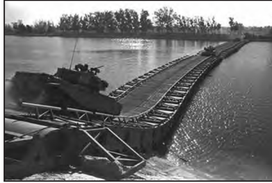
[Egyptian troops crossing the Suez Canal during the Yom Kippur War in 1973]

(a) What does Source A show you about conflict in the Middle East in 1973?