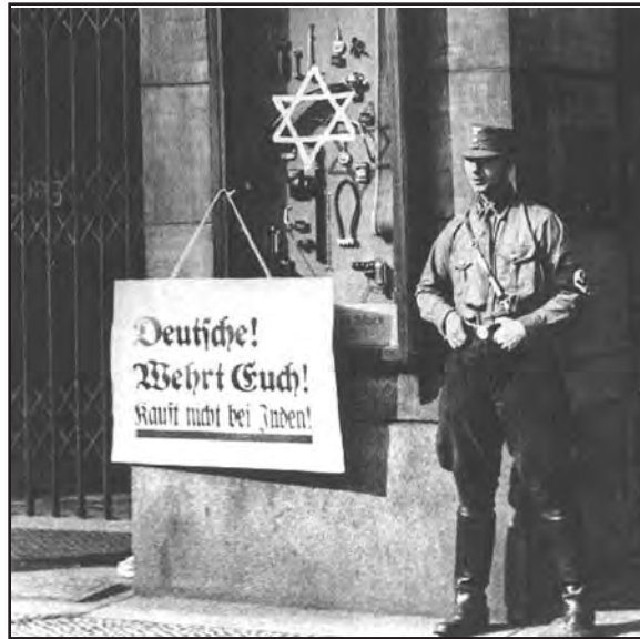
[A photograph taken at a Jewish shop in Berlin in April 1933. The sign outside the shop says Germans, don't buy here ]

(a) What does Source A show you about the treatment of Jews in the 1930s?