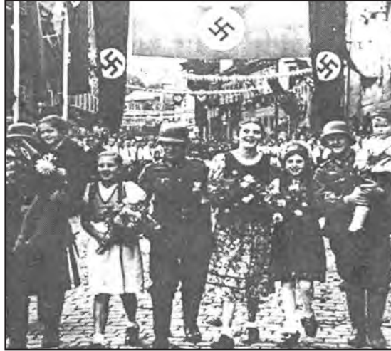
[Germans celebrating the outbreak of war in 1939]