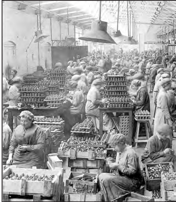
[Women working in a munitions factory in 1916]

(a) What does this photograph show you about the work done by women in the First World War? [2]