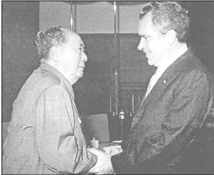
[The meeting of Chairman Mao and President Nixon in Beijing in 1972.]

(a) Use Source A and your own knowledge to describe relations between China and the USA in the 1970s. [3]