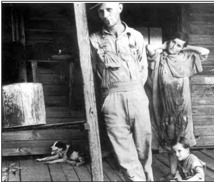
[A poor farmer and his family pictured in the mid-1920s.]