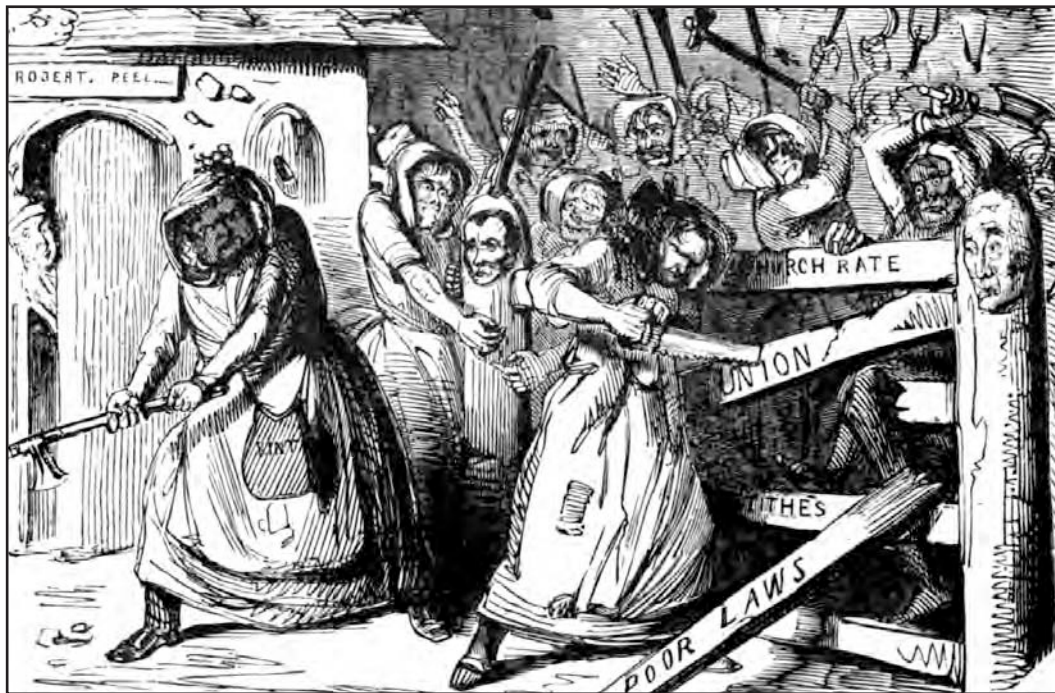
[A cartoon showing Rebecca rioters attacking a toll-gate in 1843]

(a) Use Source A and your own knowledge to describe the activities of the Rebecca rioters. [3]