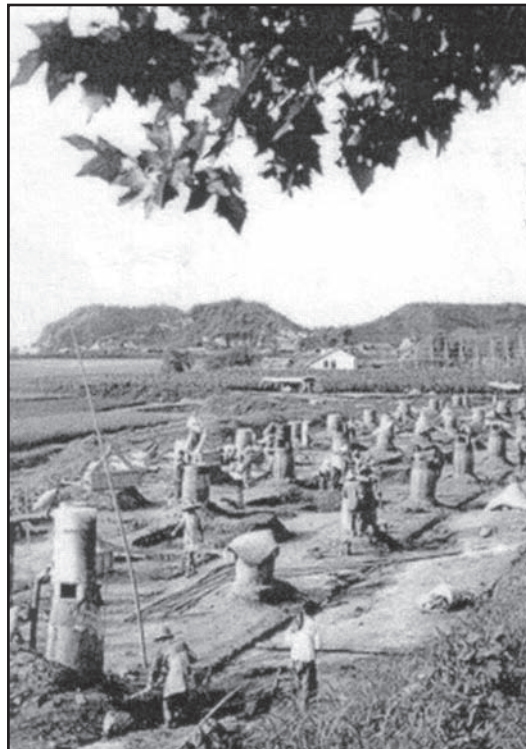
[Chinese villagers working at their own blast furnaces as part of the Great Leap Forward]

(a) Use Source A and your own knowledge to describe attempts to increase industrial production during the Great Leap Forward. [3]