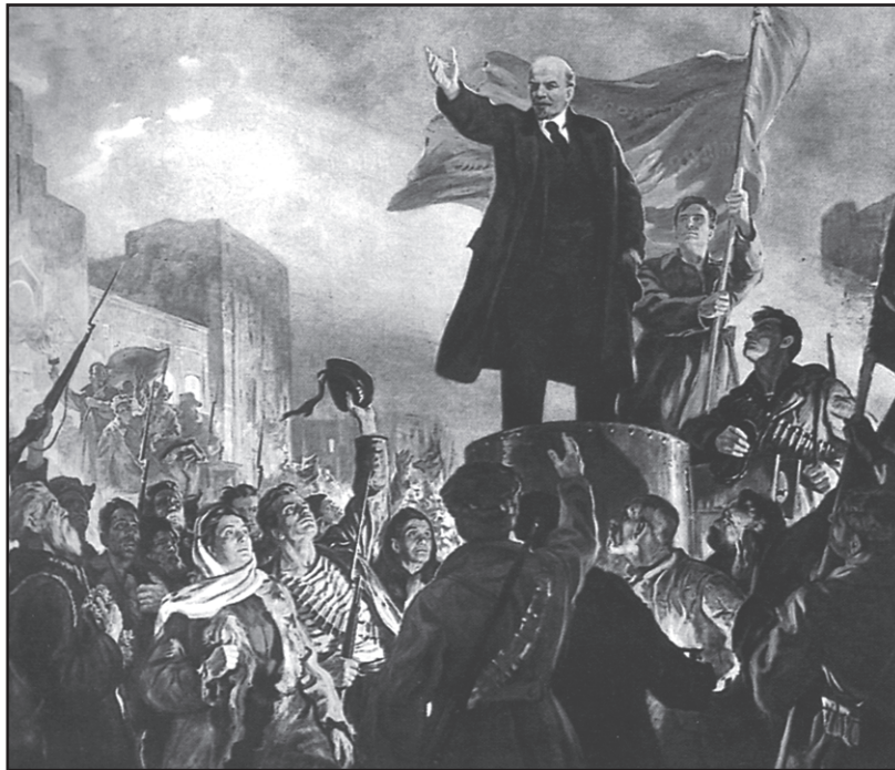
[A painting showing Lenin addressing Red Guards during the October Revolution, 1917.]

(a) Use Source A and your own knowledge to describe Lenin's role in the Bolshevik seizure of power. [3]