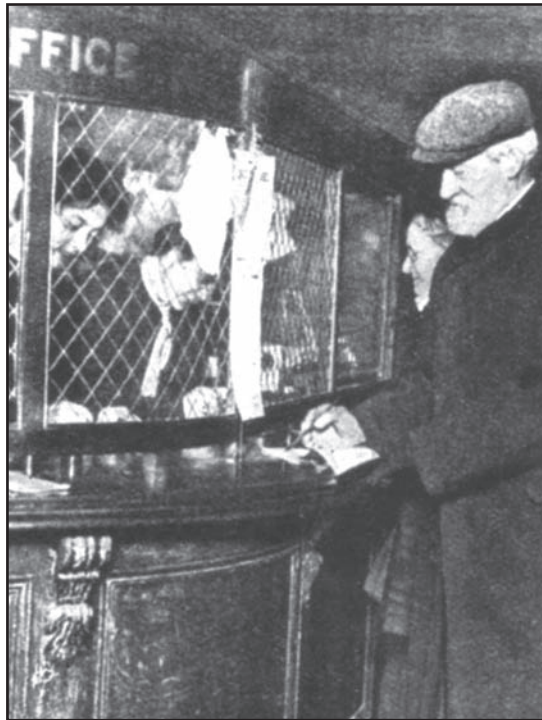
[The first person to collect an old age pension, 1909]