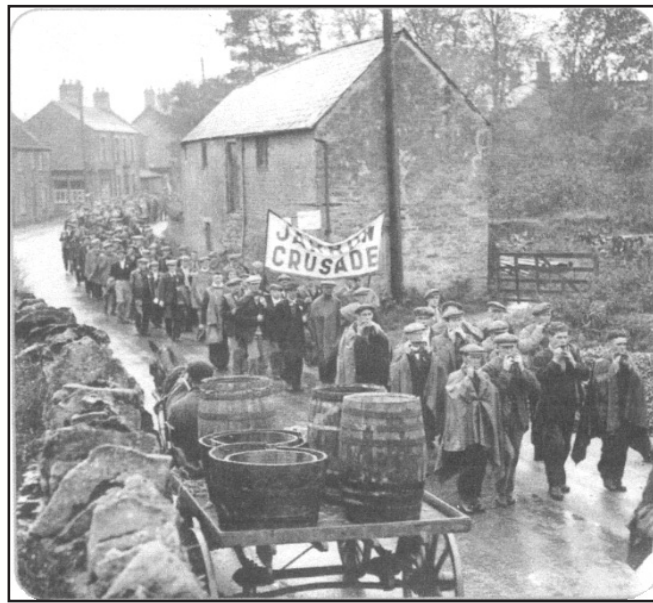
[A photograph of a protest by unemployed shipyard workers (1936)]

(a) Use Source A and your own knowledge to describe hunger marches. [3]