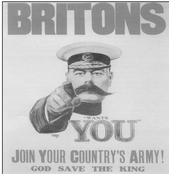
[A recruitment poster urging men to join the army in 1914]

(a) Use Source A and your own knowledge to describe the government’s recruitment campaign at the start of the First World War. [3]