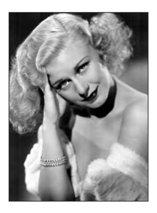
[Ginger Rogers a popular American film star in the 1930s. In 1934 there were 321 cinemas in Wales]