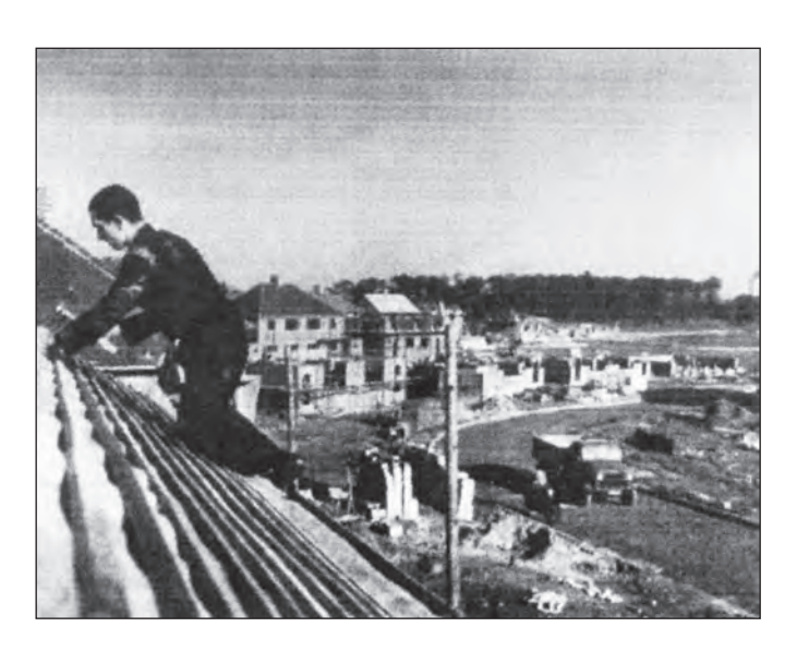
[New council houses being built in 1946]