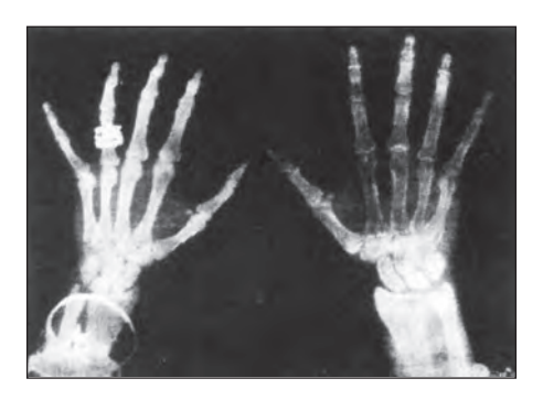
[An X-ray photograph from the early twentieth century]