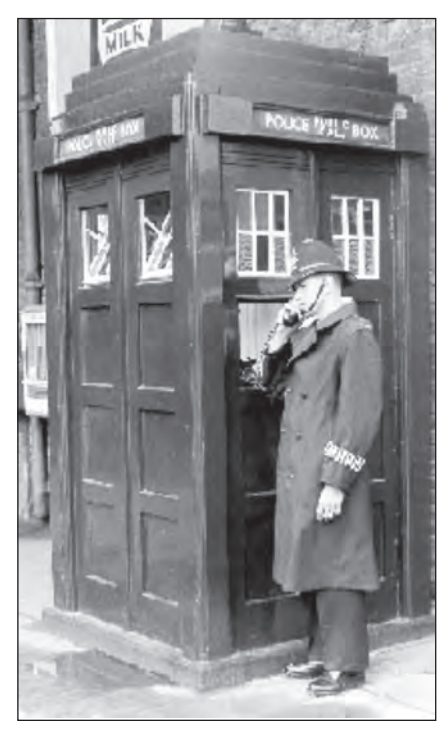
[A Police box in 1929]