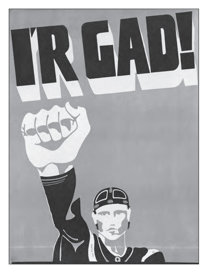
[A 1965 Cymdeithas yr laith Gymraeg [Welsh Language Society] poster with the battle cry 'Into Battle']