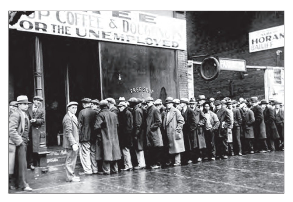
[A photograph of unemployed men in the early 1930s]