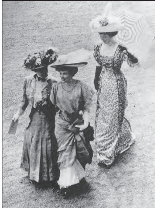
[Upper class Edwardian ladies at a horseracing meeting (1908)]

(b) Use the information in Source B and your own knowledge to explain the lifestyle and activities of upper-class women in the early twentieth century. [4]