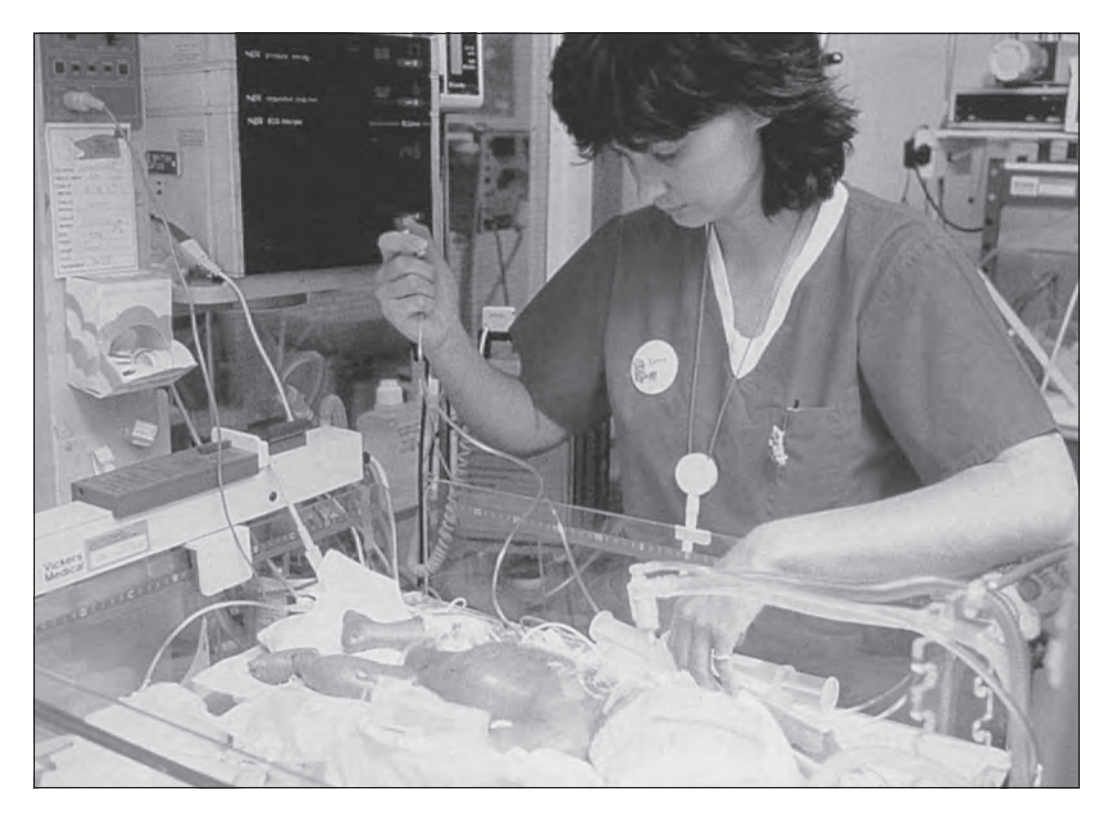
[A nurse caring for a newborn baby in a hospital maternity ward (2002)]