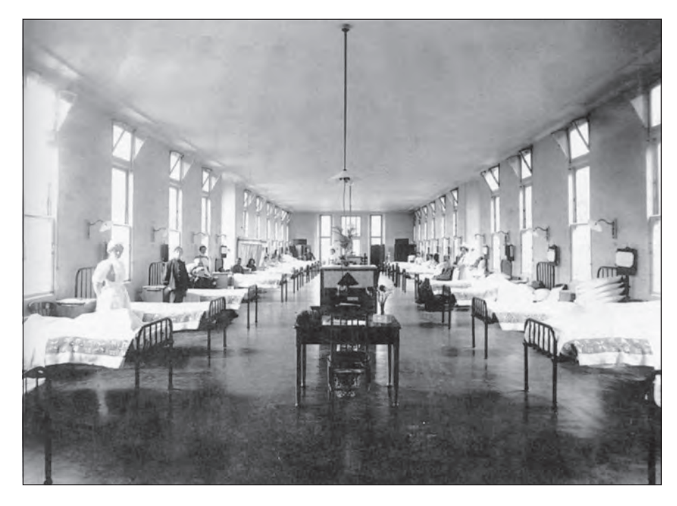
[A hospital ward in the early twentieth century]