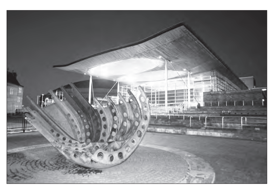
[The Senedd building, home of the Welsh Assembly, opened on July 1st 1999]