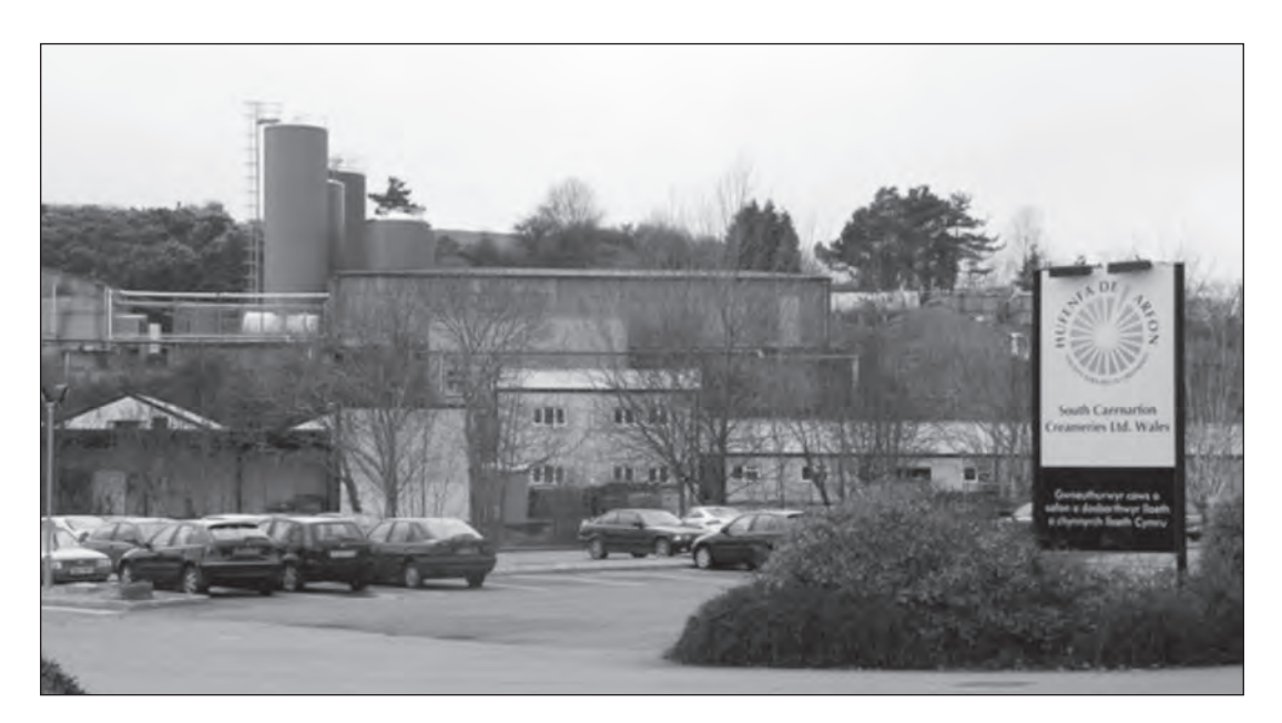
[A modern photograph of South Caernarfon Creamery, one of many farming co-operatives in north-west Wales, which now has over 200 members]