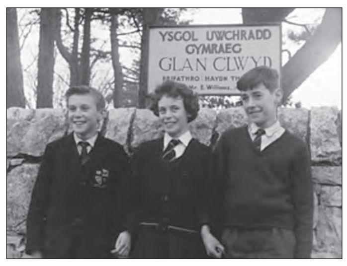
[Some of the first pupils to attend Ysgol Glan Clwyd, the first Welsh medium secondary school which opened in Rhyl in 1956]