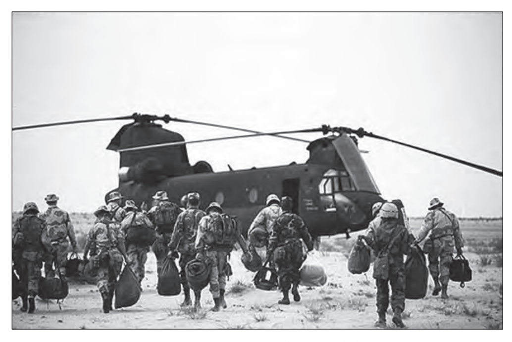
[A photograph of US troops in Kuwait in 1990]