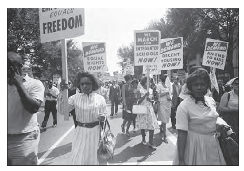
[A photograph of demonstrators marching in Washington in 1963]