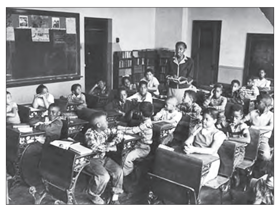
[A photograph taken in a school for black American pupils in the early 1950s]