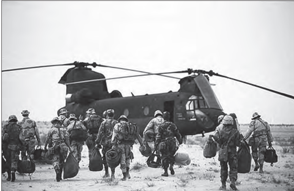
[A photograph of US troops in Kuwait in 1990]

(a) What does Source A show you about US involvement in the Gulf War?