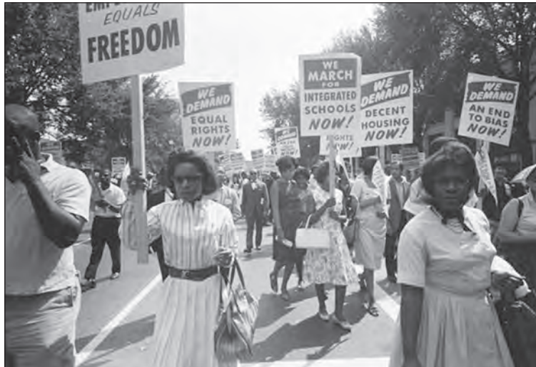
[A photograph of demonstrators marching in Washington in 1963]

(a) What does Source A show you about some black Americans in the 1960s?