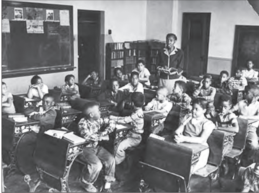
[A photograph taken in a school for black American pupils in the early 1950s]