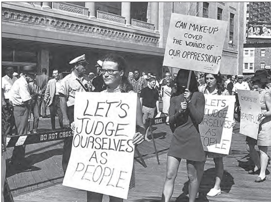
[A photograph of women protesting at the Miss American Beauty Contest in 1968]