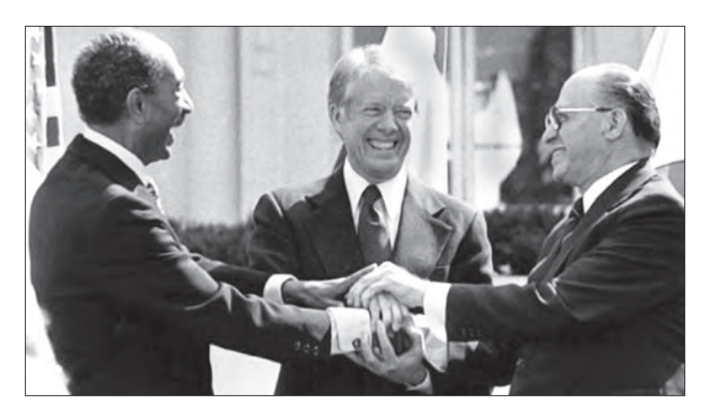
[A photograph of a meeting at Camp David in 1978 to create peace in the Middle East]