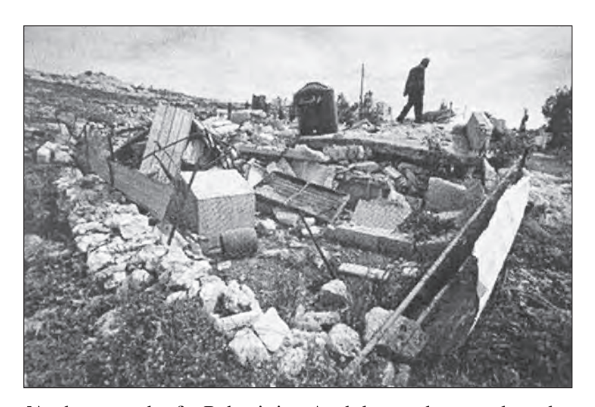
[A photograph of a Palestinian Arab house destroyed on the West Bank to make way for a Jewish settlement (1997)]