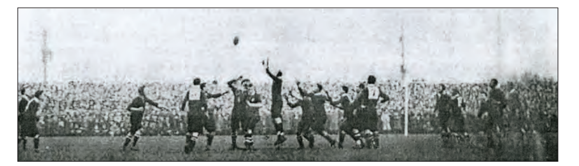
[A picture taken during a rugby international at Swansea in 1906]

Study the photograph below and then answer the questions which follow.