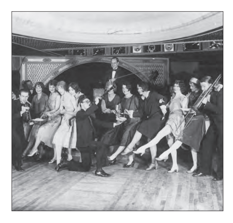
[A photograph of young Americans dancing to jazz music in a club in New York in the 1920s]