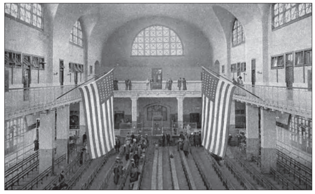
[The photograph shows immigrants in the inspection room at Ellis Island, New York.]

Study the source below and answer the questions which follow.